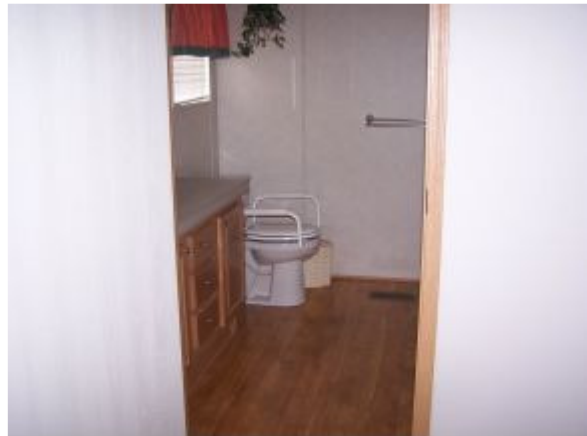
SECOND BATHROOM DW