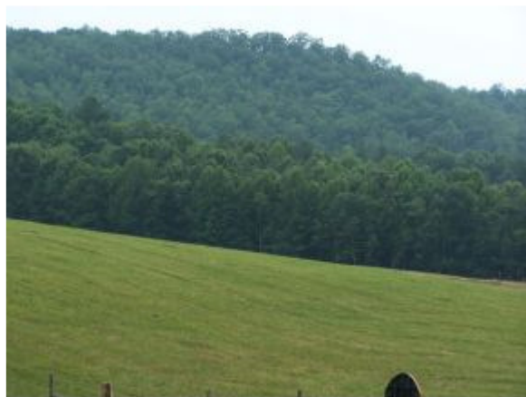
VIEW OF PASTURE