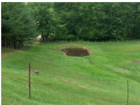
VIEW OF POND