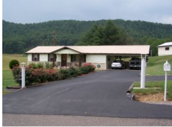
RANCH STYLE HOME